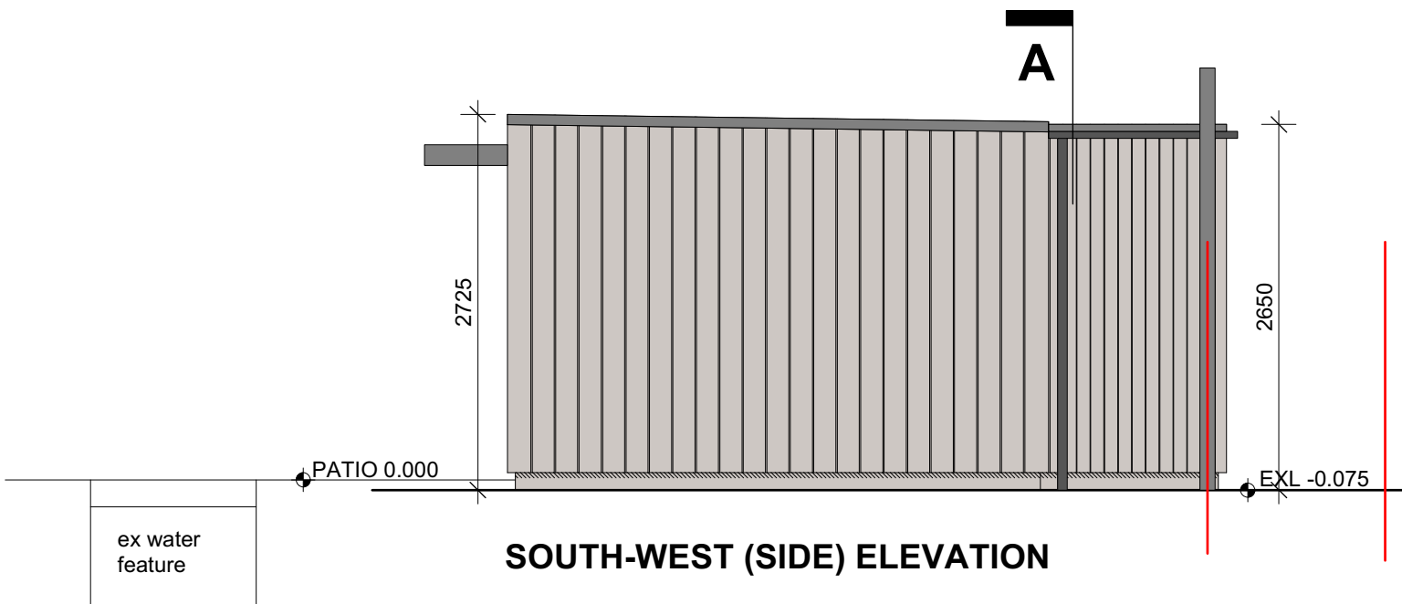
SOUTH-WEST (SIDE) ELEVATION